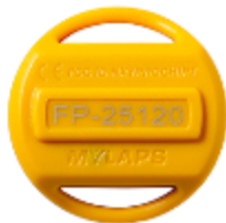
*ProChip Timer Go