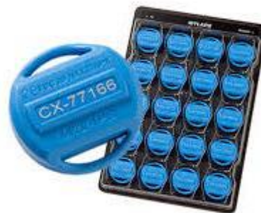
**ProChip Timer + Communicator