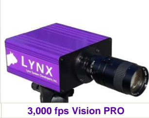
3,000 fps Vision PRO

"There should be at least two photo finish cameras in action, one from each side. Preferably, these timing systems should be technically independent, i.e. with different power supplies and recording and relaying of the Starter's signal, by separate equipment and cables." - IAAF Rule 165:20 (2014-15)