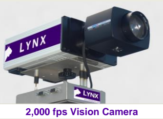
2,000 fps Vision Camera

IAAF-Approved 3-Camera Timing System (1 Vision + 1 Vision PRO + 1 IdentiLynx) with Camera Upgrades, AirLynx Wireless, ResultTV, and 2 Start Systems For Full Timing Redundancy