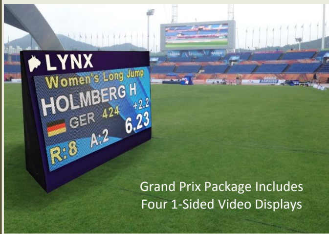
Grand Prix Package Includes Four 1-Sided Video Displays

Field event marks are entered into FieldLynx on a netbook computer and then the ResultTV software outputs vector graphics directly to the video board. Athlete names, performances, rankings, and other event info can be sent directly from the netbook using ResultTV to display dynamic, high-visibility graphics. Choose from a number of default templates or customize your graphics for the event by adding custom colors, images, logos, or gifs.